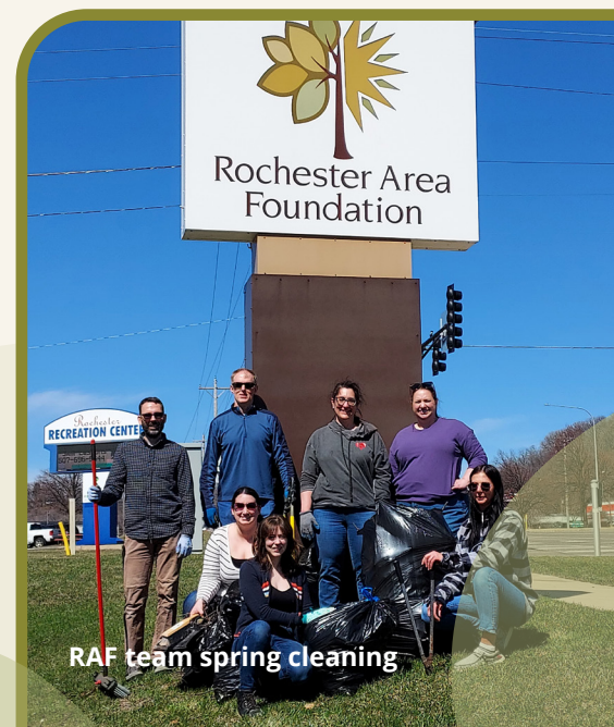
RAF team spring cleaning