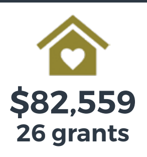
Environment & Animal Welfare